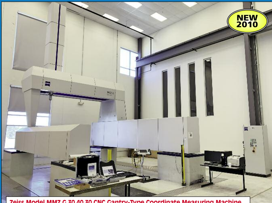
Zeiss Model MMZ C 30 40 30 CNC Gantry-Type Coordinate Measuring Machine