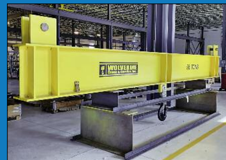
55 Ton X 25' Span Wolverine Crane Spreader Bar

Late Model Office Equipment Including; Conference Room w/ Chairs, Polycom Video Conferencing System, 3-Person Work Stations, Lateral File Cabinets, Lockers, Computers, Printers, Copiers, Server Racks