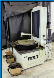
DCM Model MPI 4830B Magnetic Particle Tester