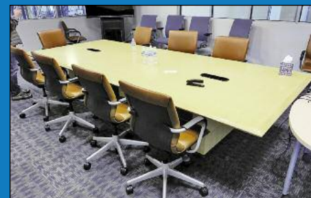
Late Model Office Equipment