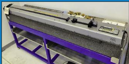
Tesa Model TPS 1500 Motorized Setting Bench w/Stand