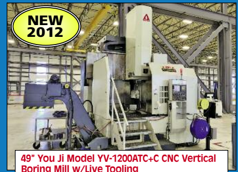
49" You Ji Model YV-1200ATC+C CNC Vertical Boring Mill w/Live Tooling