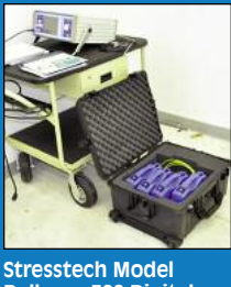
Stresstech Model Rollscan 300 Digital Barkhausen Noise Analyzer