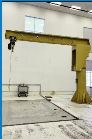
(4) Gorbel Free-Standing Jib Cranes