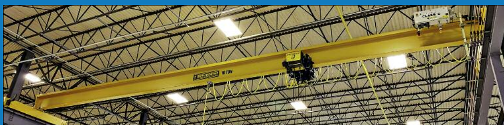
(3) 10 Ton X 60' Span Wolverine Crane Single Girder Bridge Cranes