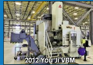
2012 You Ji VBM