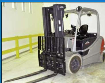
9,000 Lb. Linde Model RX60-50 Non-Marking Tire Electric Lift Truck