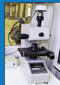
Leico LM 100AT Microindentation Hardness Tester