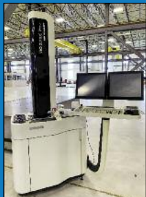
DCM Model VIO 20/100 Linear Tool Presetter