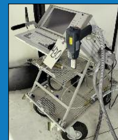
Belec Type BCPO Compact Port HLC Portable Hybrid Metal Analysis Spectrometer