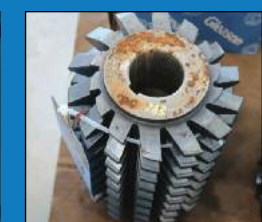
Large Quantity of Gleason Opti Cut, Banyan, Cutter Bodies, Hobs, Shaper Cutters, Arbors, Carbide & More