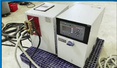
Ambrell Model Ekoheat 50/10 ES Digital Bearing Heater Controller w/ Ambrell 301-0353.A Bearing Heater & Koolant Coolers HCV 3000 Chiller