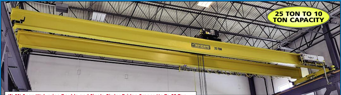
(6) 60' Span Wolverine Double and Single Girder Bridge Cranes Up To 25 Ton

INSPECTION: MONDAY, JANUARY 20TH, FROM 10:00 AM TO 4:00 PM or by appointment with joe@cia-auction.com