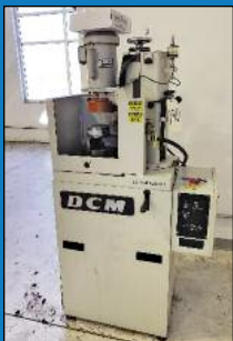
8" DCM Model Mini Punch and Die Grinder