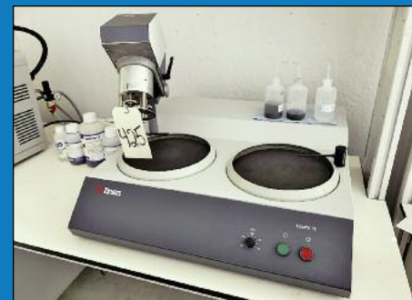
Struers Model Labopol-25 Lapping Machine