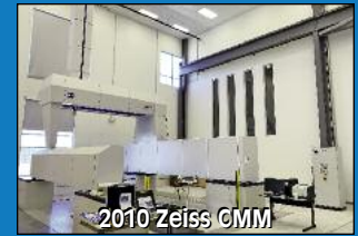
2010 Zeiss GMM