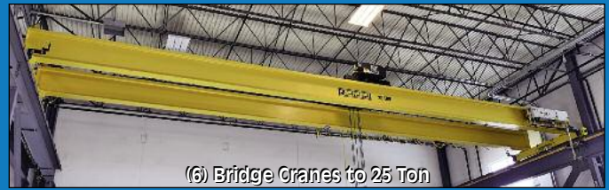
(6) Bridge Cranes to 25 Ton

Contact Information 2020 Dunlap St. Cincinnati, Ohio 45214 Phone 513-241-9701 Fax 513-241-6760 www.cia-auction.com